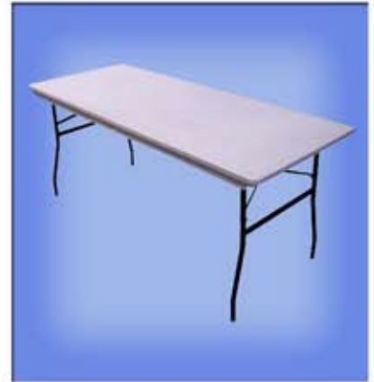
Rectangular Table B