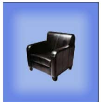
Sofa Leather B