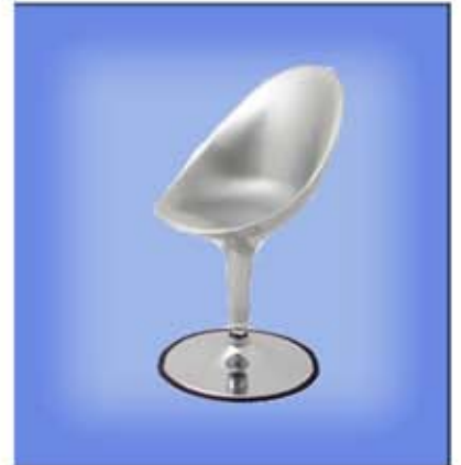
Bar Stool B