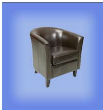
Sofa Leather A