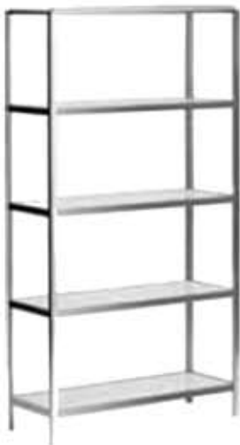
Display Shelving 5 Tier