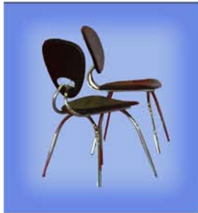
Leather & Chrome Chair