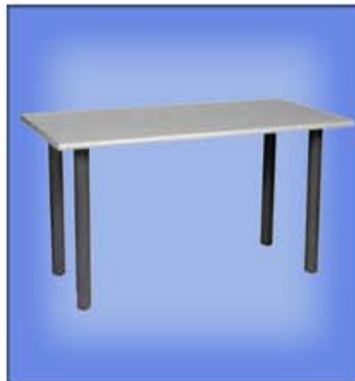
Rectangular Table A