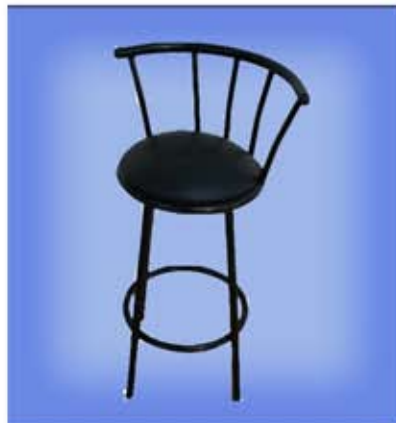
Bar Stool A